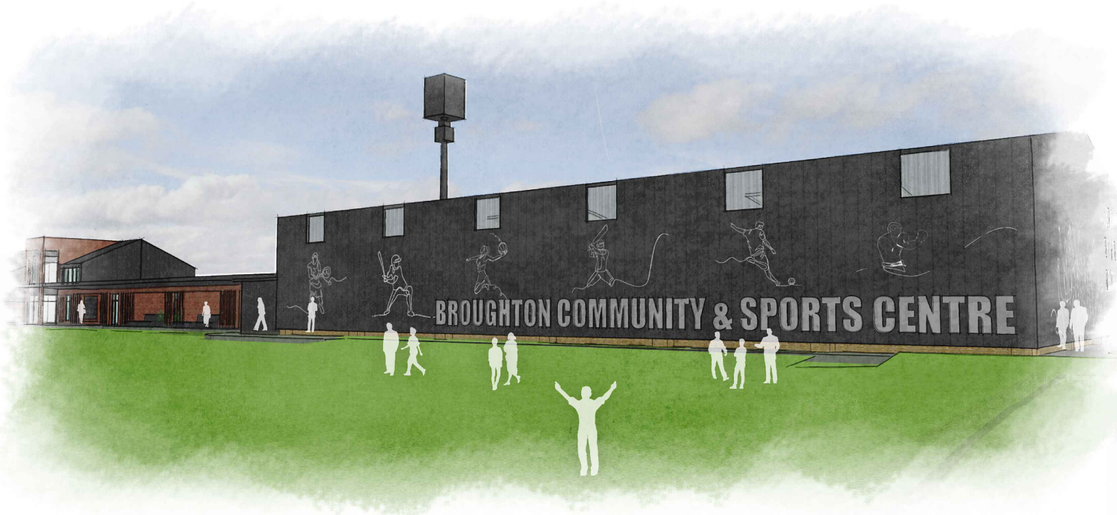
Extended & Refurbished Sports Hall

General Notes Drawing based on Ordnance Survey data and subject to full topographical line and level survey. All drawing information should be taken from figured dimensions only. Do not scale.