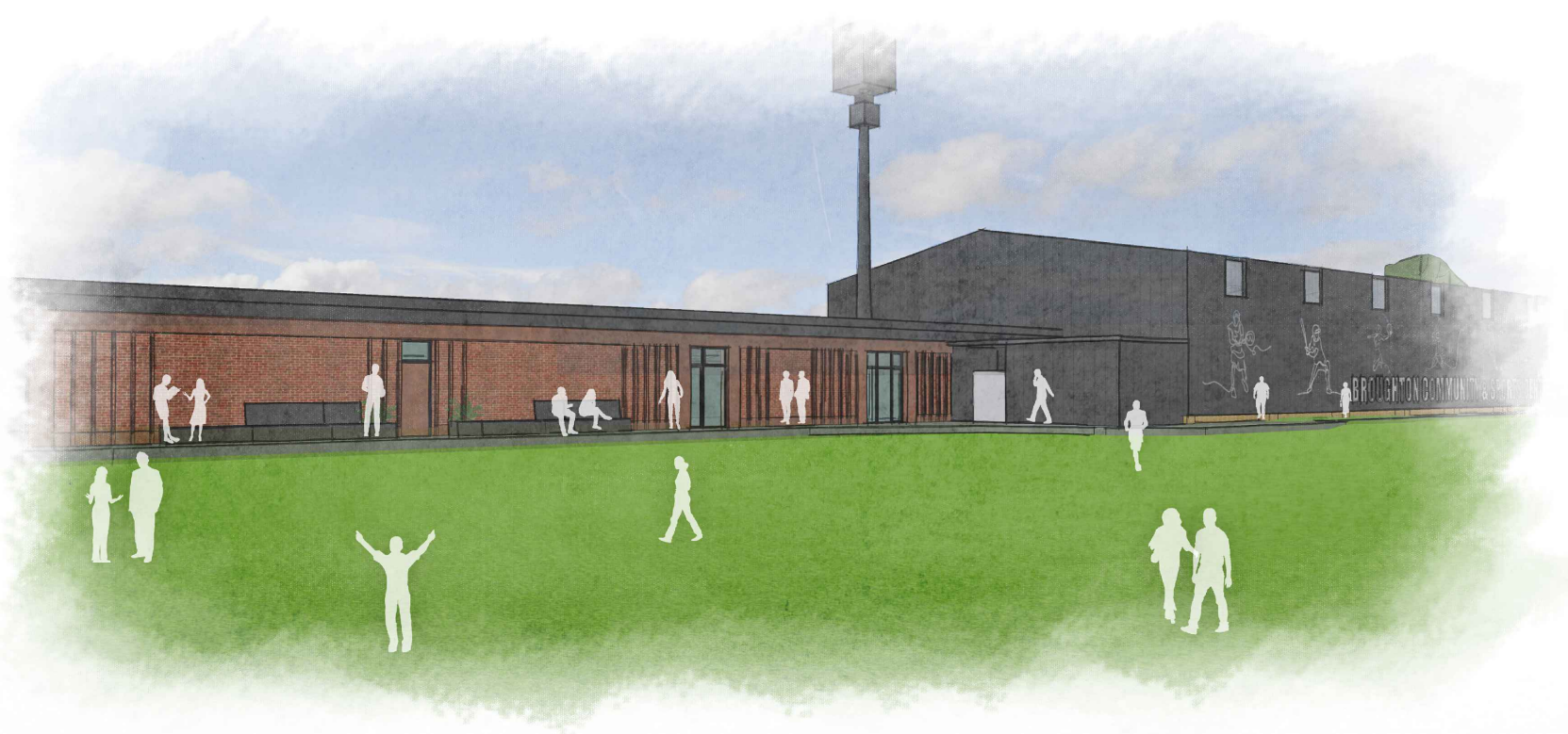
Changing Area & Covered Walkway with Seating