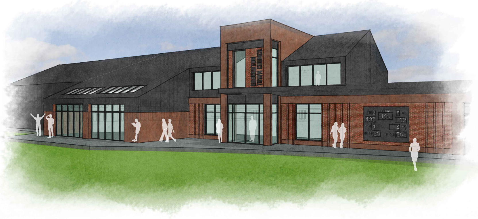
Reception, Offices, Community Rooms