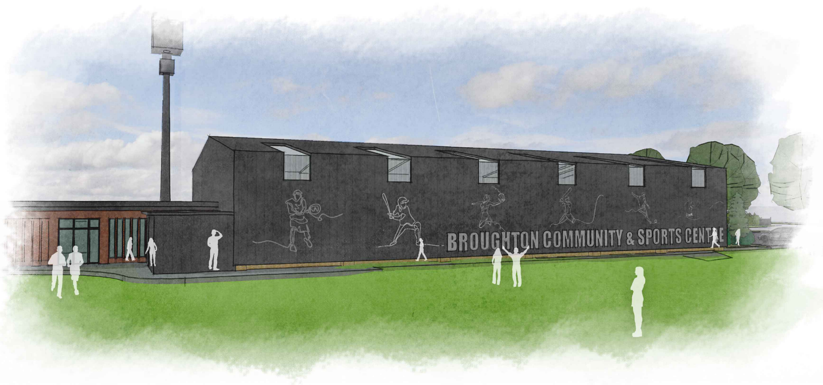
Extended & Refurbished Sports Hall